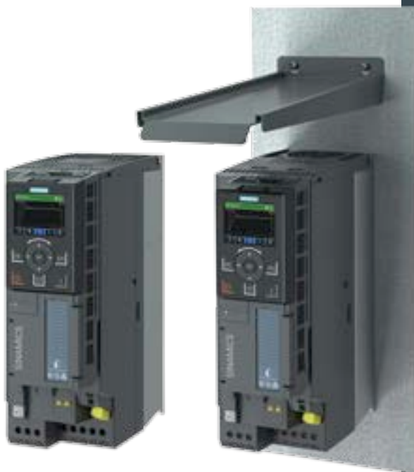
Protection class IP20

Water and air are powerful natural forces. Master them – then you can tap on the power that they represent. For a higher quality of life. For a higher degree of sustainability. For a better future. Frequency converters play a significant role when it comes to harnessing the forces of nature for everyone's benefit. The SINAMICS G120X series is the new addition to the SINAMICS family of frequency converters. The series specializes in controlling motors which pump water or propel air – and is extremely impressive thanks to its outstanding simplicity, reliability and efficiency. With SINAMICS G120X, you master the elements. How do you utilize their power?